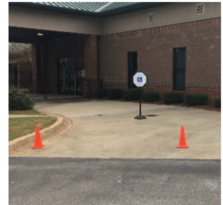
Separate curbside parking location