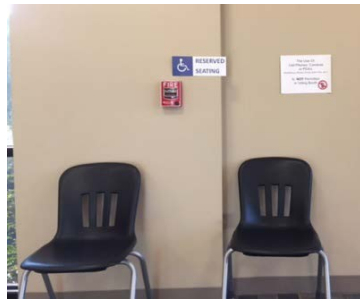
Seating area for those who cannot stand in line.