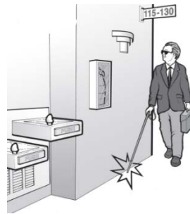
Mark barriers such as water fountains with a cone so they are detectable.