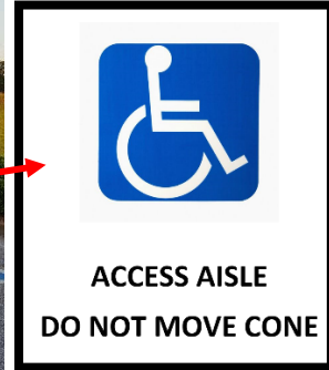
Temporary accessible parking space with access aisle