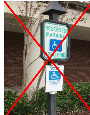
Accessible parking should not be used for curbside voting