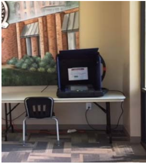
Machine at appropriate height for a wheelchair user.